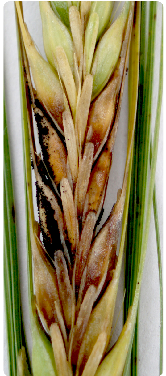
Fusarium head blight on barley.

Then about a decade ago, Hayes’ program at Oregon State released the GNO variety ‘Full Pint’ ( https://bit.ly/3Y5RpPi ). The appearance of the GNO allele in the Oregon State breeding program and Full Pint’s subsequent GNO status was also a happy accident, Hayes says. “It’s a testimony to the power of free exchange of germplasm between breeding programs because it just came kind of hitchhiking along with crosses that we had made with material from the ICARDA/CIMMYT program in Mexico”