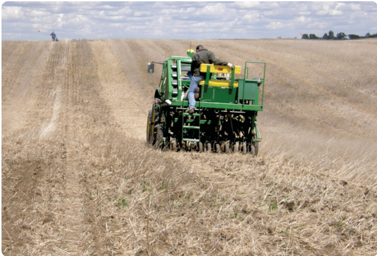
Figure 1. Small-plot seeder establishing strips 7.5 ft in width down the length of the field.