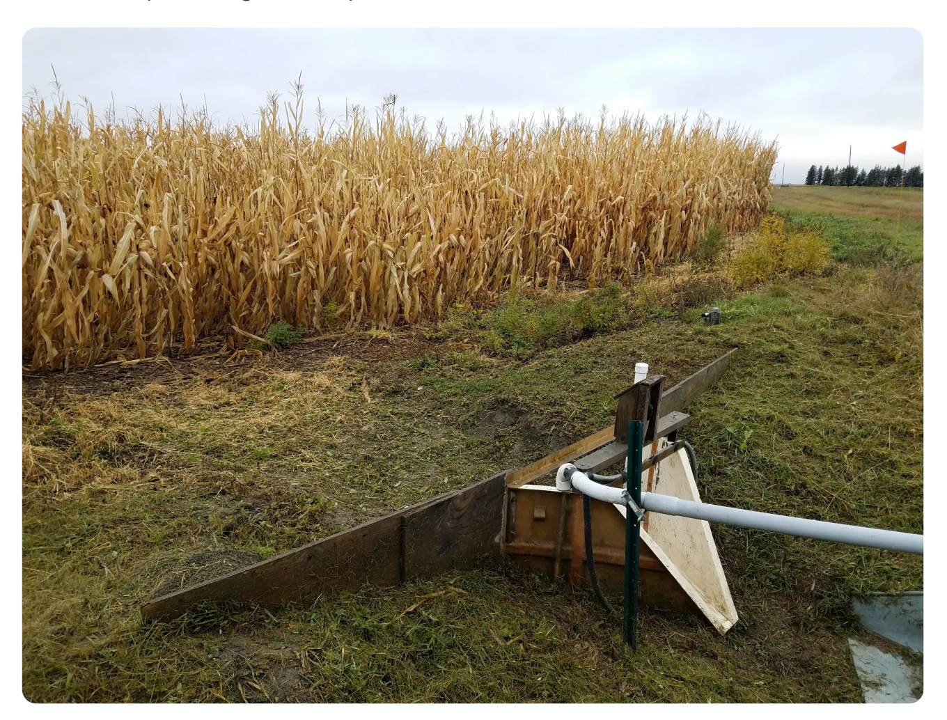
Edge-of-field monitoring helps capture and analyze field runoff continuously, rather than readings being taken periodically.

Index is considered a weighted and additive model that provides a sense of phosphorus loss potential by considering three forms of edge-of-field phosphorus loss, Pease explains. These include sediment-bound P in rainfall runoff, known as particulate P; soluble P in rainfall runoff, known as soluble P; and soluble P in snowmelt runoff, known as snowmelt P. The researchers wanted to test if the MNPI was both "directionally and magnitudinally correct."