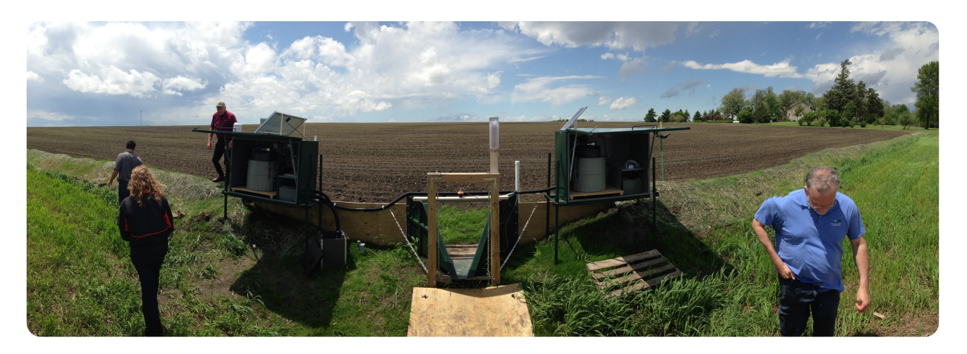
Fields are monitored using surface water and tile drainage monitoring stations, such as this one in Dodge County, Minnesota. Automated monitoring equipment is shown in the green boxes.

the nonprofit Minnesota Agricultural Water Resources Center and works to collect credible data that can be used for research and educational purposes to help farmers deal with water quality challenges.