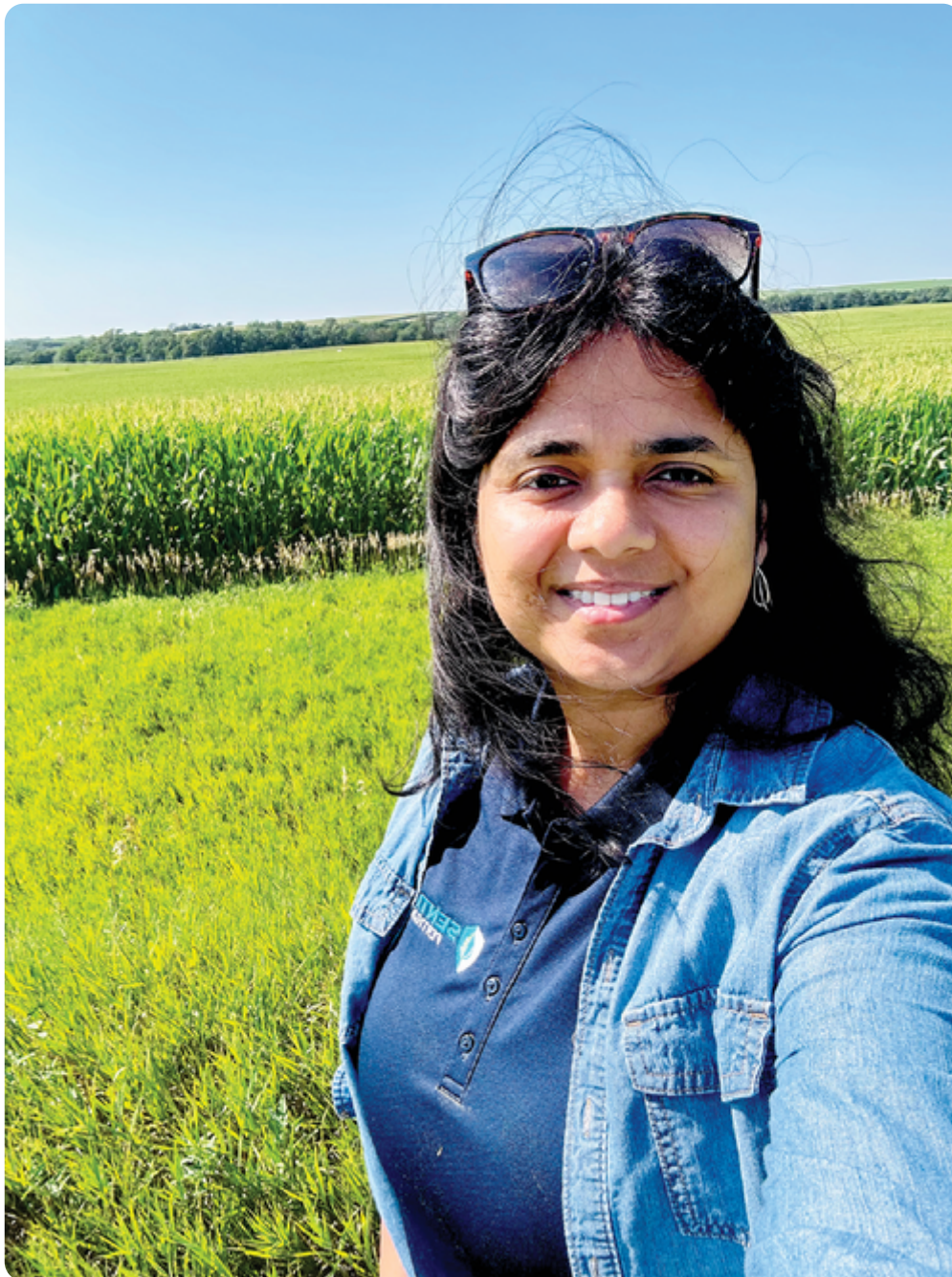
Figure 2. Scouting a corn field in eastern Nebraska.

2. Multi-Source Data Fusion: Artificial intelligence can also integrate data from multiple sources, such as drones, satellites, and ground-based sensors, to provide a continuous stream of information. When satellite imagery is disrupted by cloud cover, data from drone flights or proximal sensors can be fused to maintain a comprehensive view of the field. This integration allows for more robust nitrogen