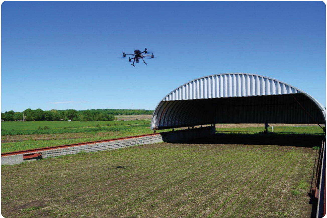
Figure 3. Drone flight in the alfalfa-sown rainout shelter plots in Manhattan, KS.