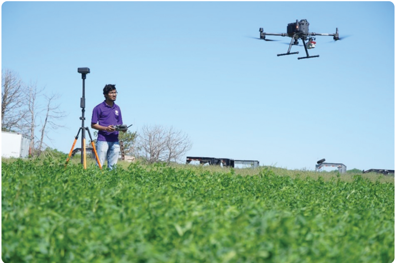
Figure 2. Collecting thermal and multispectral images of alfalfa.