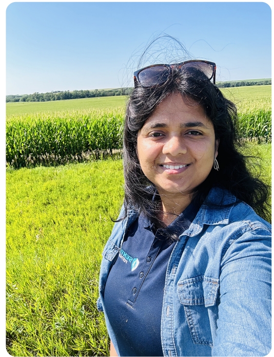
Figure 2. Scouting a corn field in eastern Nebraska.

However, nitrogen is not the only nutrient that crops require in balanced amounts. Other indices can target different nutrients, each critical for plant health. For instance, the chlorophyll index (CI) is used to estimate chlorophyll content and can be useful for both nitrogen and phosphorus monitoring while the soil-plant analysis development (SPAD) index is often used to evaluate chlorophyll levels and general plant health. Together, these indices offer a more comprehensive understanding of nutrient status and can inform more nuanced nutrient management strategies.