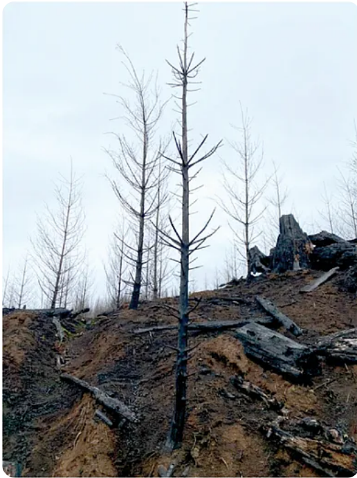
Downslope movement of soil at the study site.

A severe fire such as occurred at the study site burns all the soil organic matter on the forest floor. A low-severity fire partially scorches the forest floor. The study site fire left 100% mortality of trees on the site.