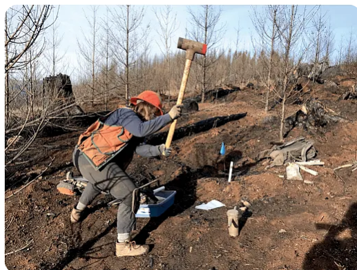
Hammering the soil core into the soil to collect a sample down to 30 cm.

Further study of the drivers of post-fire soil C changes is needed, so we can adapt landscapes to withstand climate change and increasing fire frequency while maximizing soil C storage. Long-term analysis of soil C at a site such as this may be able to separate changes into fire-induced, harvest-induced, and interactive causes. Studying soil C long term on sites with a variety of management landscapes, including beetle-killed and non-clear-cut-harvested sites, will help identify actions that may preserve soil C after a severe wildfire.