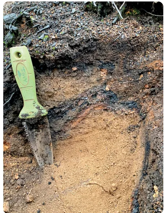
Typical soil profile at the study site, 0–30cm.

The study did not ascertain where lost soil C went although McCool's ongoing Ph.D. work is attempting to find out on another site that burned in the Labor Day fires. Besides erosion, soil may have been carried off by the strong winds that drove the fire, and C was probably lost largely in smoke.