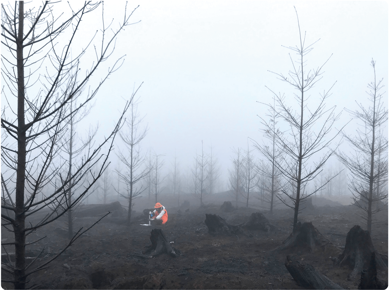
This site in the western Cascade Mountains in Oregon experienced a high-severity wildfire in September 2020. Here a researcher samples the soil in the winter of 2021 after the fire.

The world's temperate forests, such as those occurring on the western slopes of the Cascade Mountains in Oregon, are estimated to hold 500 gigatons of carbon (C).