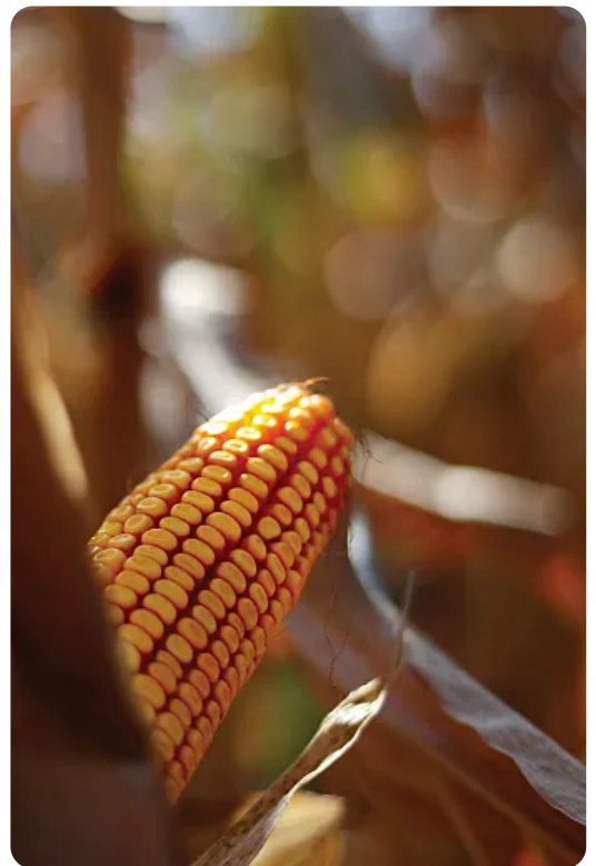
"Corn's Golden Symphony" by Nitish Inu was the Agronomy Best Photo during the photography and video contest held during the 2023 Annual Meeting in November.